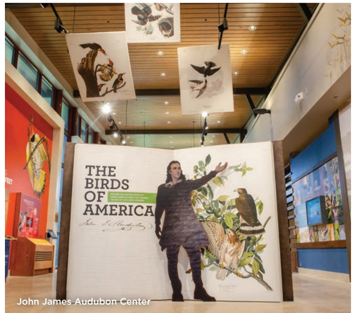
John James Audubon Center

Golf enthusiasts can tee off at a collection of beautifully maintained Golf Courses , set against rolling Countryside backdrops that feel like an extension of the greens.