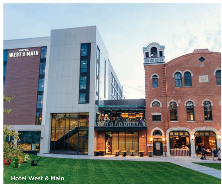
Hotel West & Main