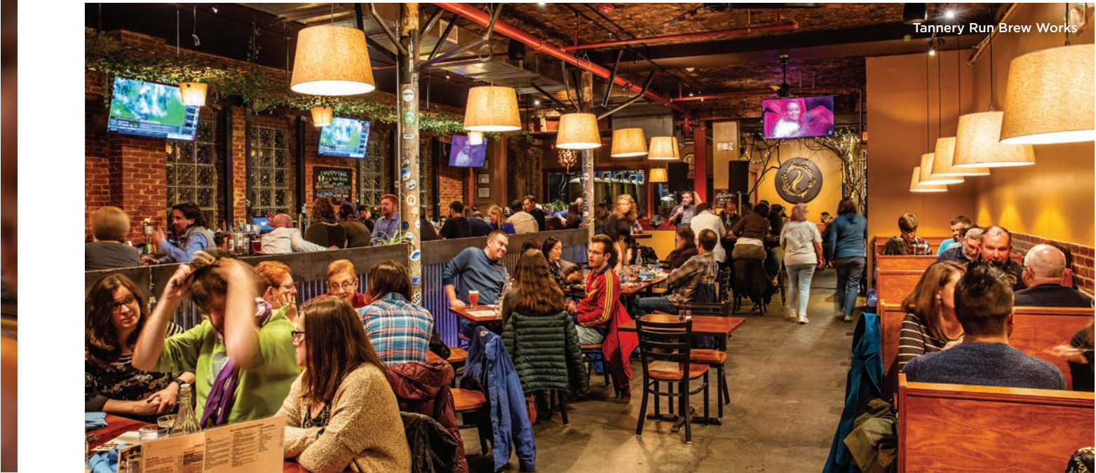
Tannery Run Brew Works