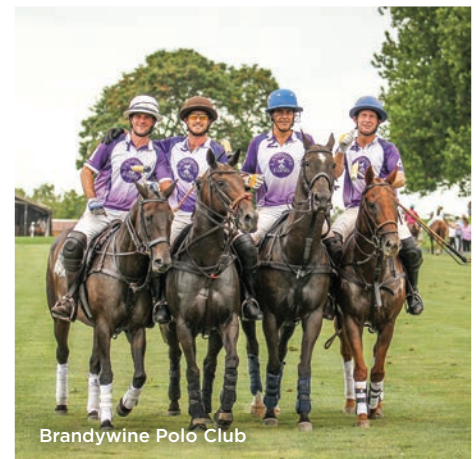
Brandywine Polo Club