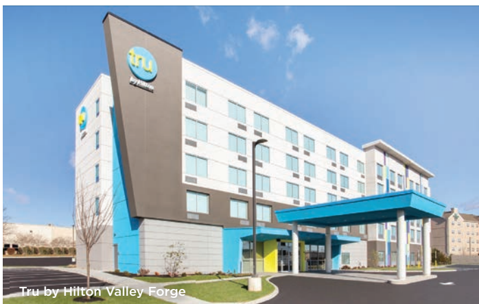
Tru by Hilton Valley Forge