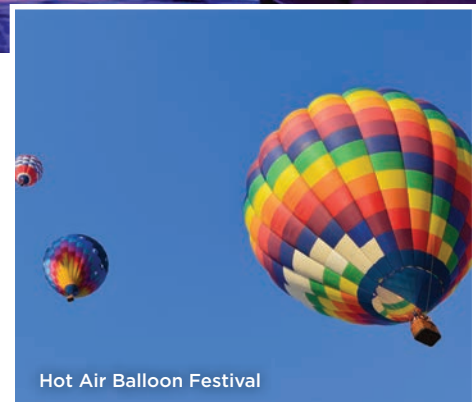
Hot Air Balloon Festival

Philadelphia boasts its own vibrant calendar of events: enjoy an excursion for unique city experiences and retreat back to the tranquility of The Countryside.