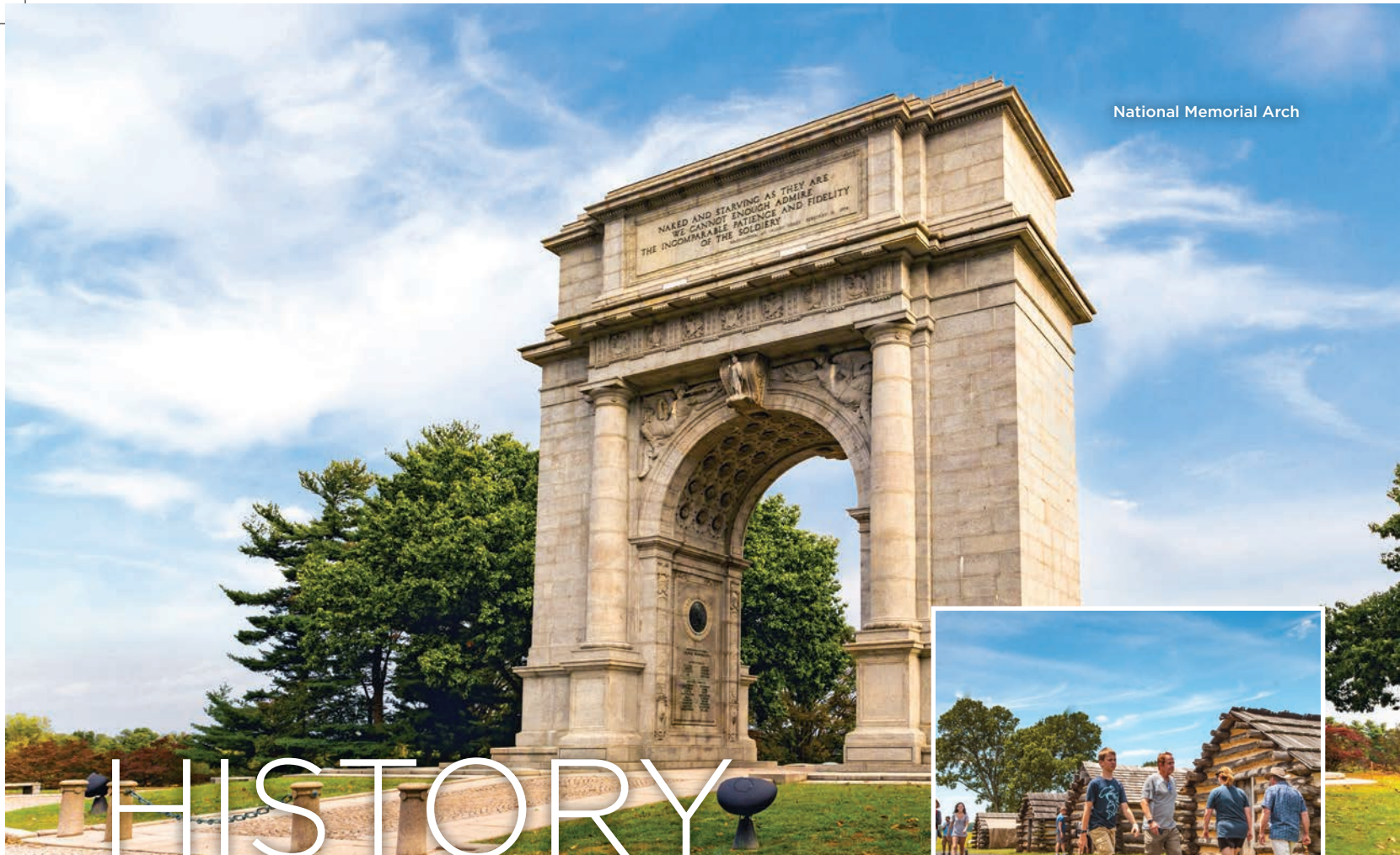
National Memorial Arch