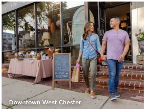
Downtown West Chester

Explore distinctive shopping destinations throughout The Countryside of Philadelphia: clothing and shoes are always tax-free! King of Prussia Mall —the largest retail complex on the U.S. East Coast—features over 450 stores, and an impressive collection of luxury retailers (including Cartier, Gucci, and Louis Vuitton).