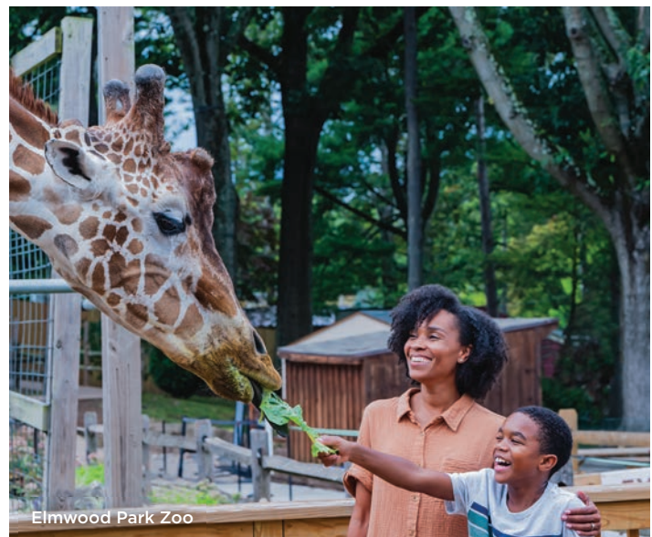
Elmwood Park Zoo