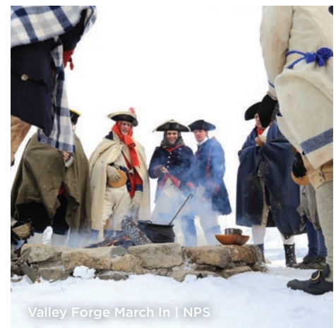
Valley Forge March In