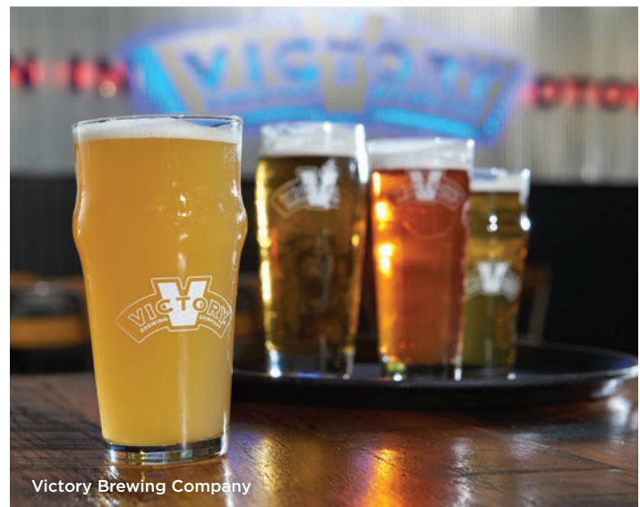
Victory Brewing Company

For craft cocktails, Bluebird Distilling , Botanery Barn Distillery , and Boardroom Spirits produce a range of local spirits— expertly mixed into flavorful, inventive drinks that highlight their unique distilling styles.