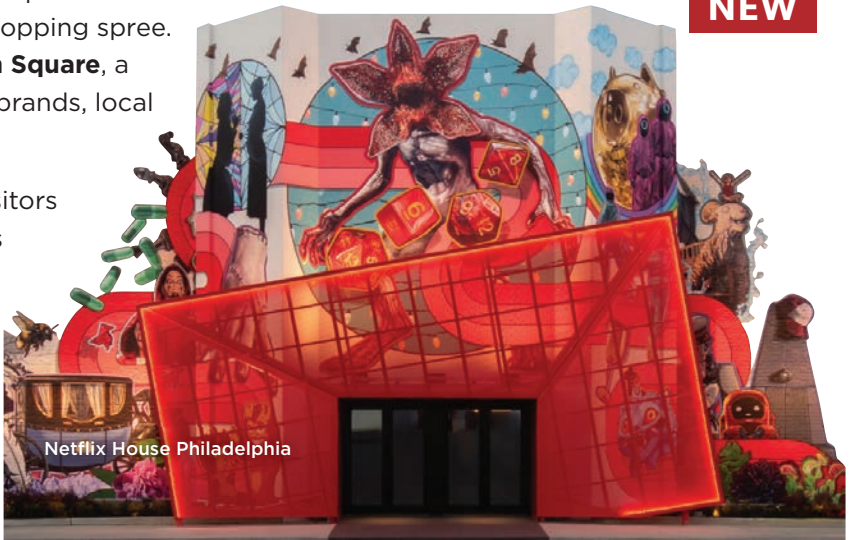
Netflix House Philadelphia