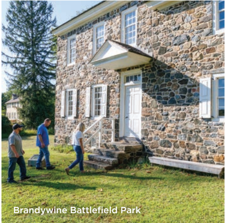
Brandywine Battlefield Park

The rolling hills of the Brandywine Battlefield Park commemorate the Battle of Brandywine, featuring a replica of General George Washington's headquarters and annual living-history battle reenactments staged on the storied landscape.