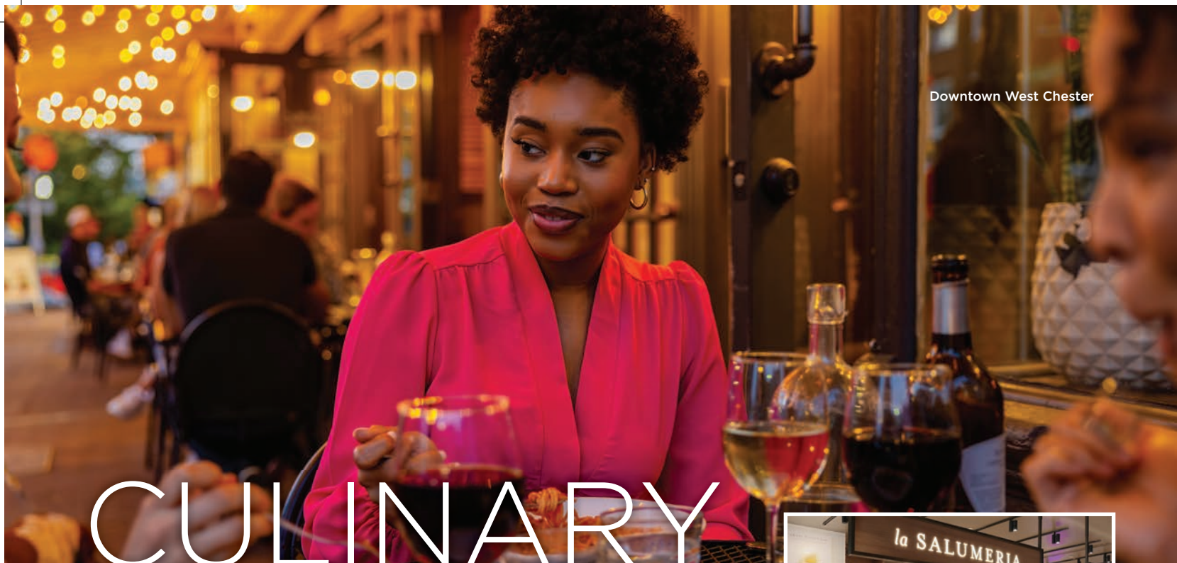
Downtown West Chester