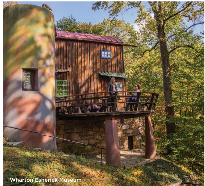
Wharton Esherick Museum