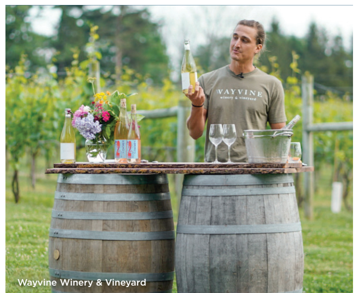
Wayvine Winery & Vineyard