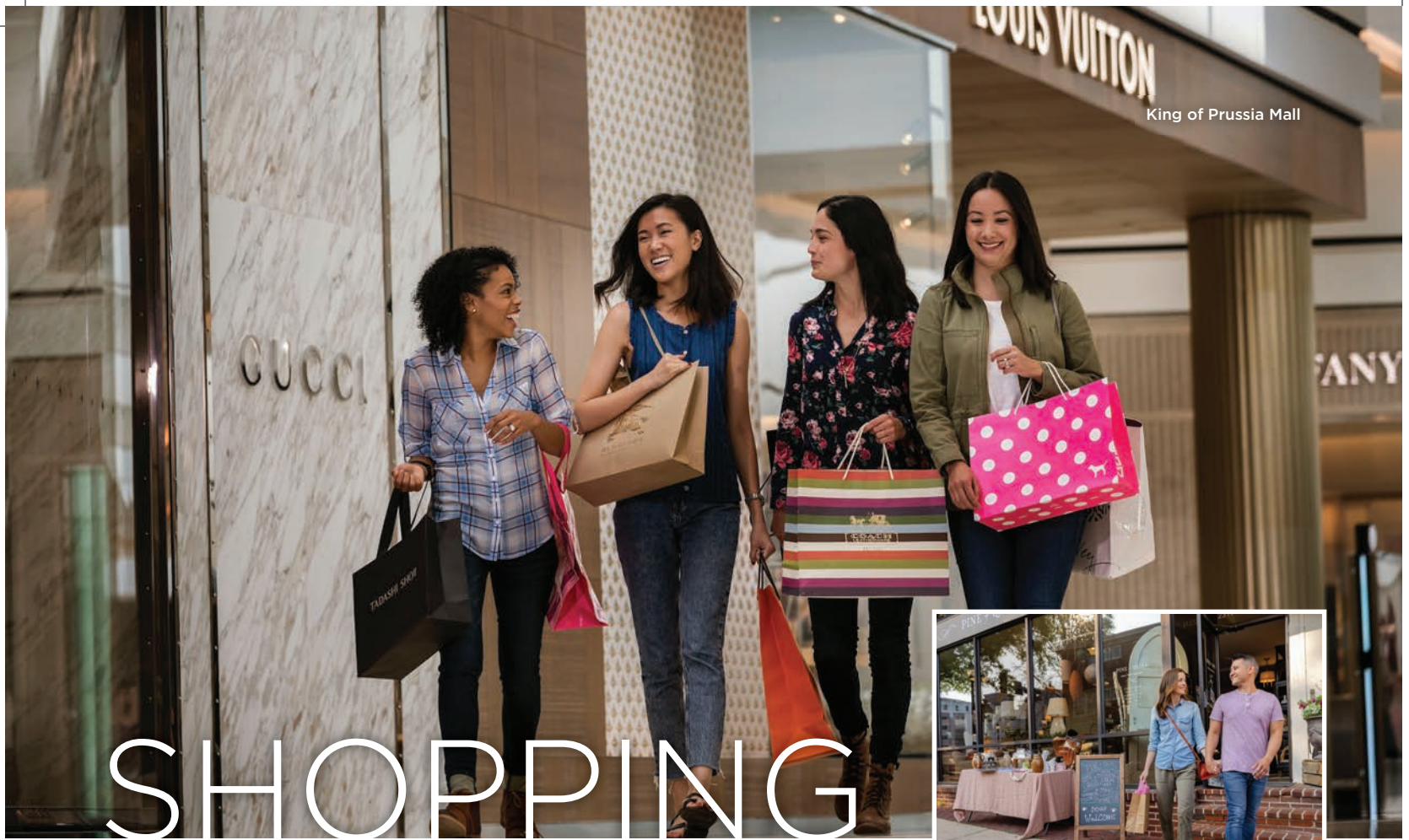
King of Prussia Mall