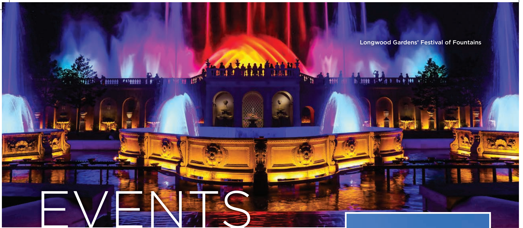
Longwood Gardens' Festival of Fountains

Events, festivals, and seasonal experiences add a unique, cultural flair to tours of The Countryside of Philadelphia.