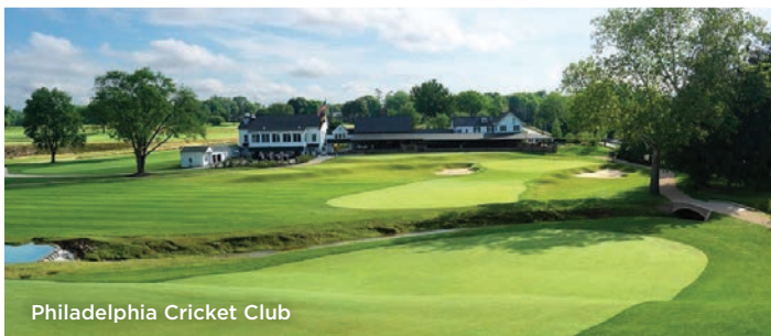
Philadelphia Cricket Club