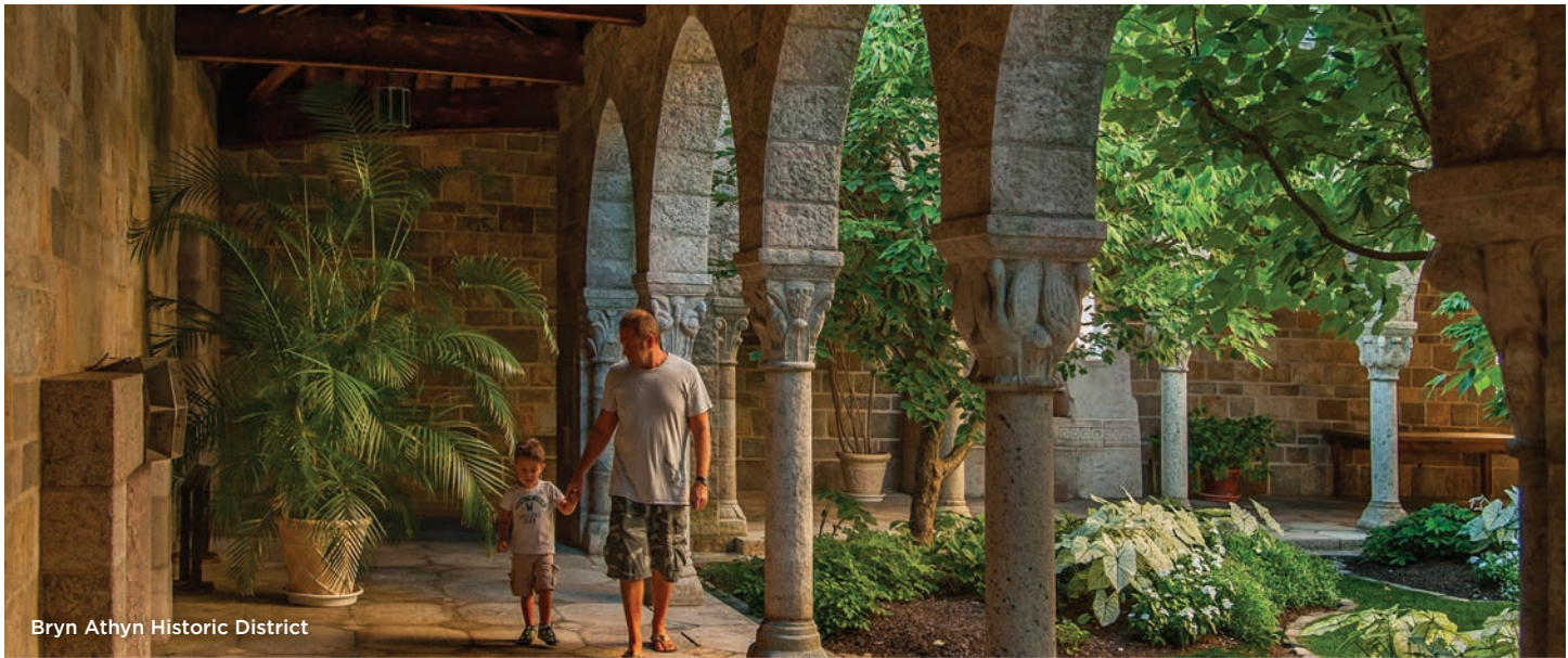
Bryn Athyn Historic District