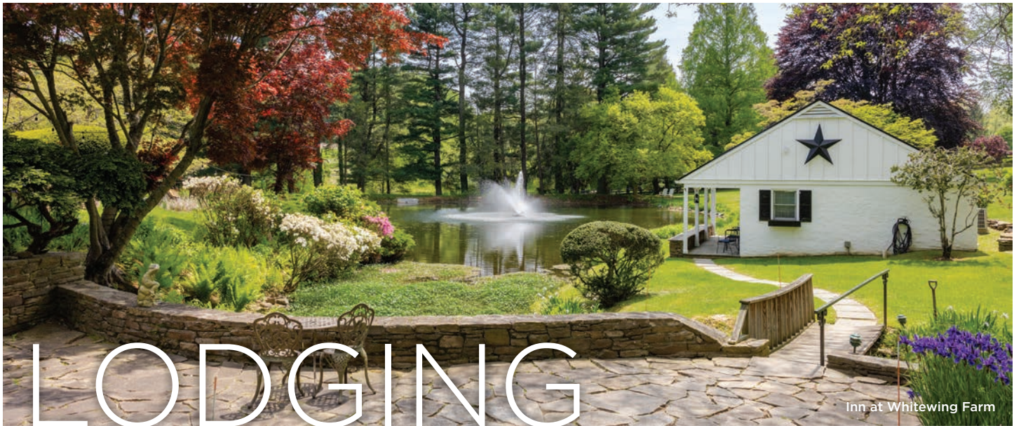
Inn at Whitewing Farm