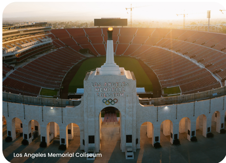
Los Angeles Memorial Coliseum