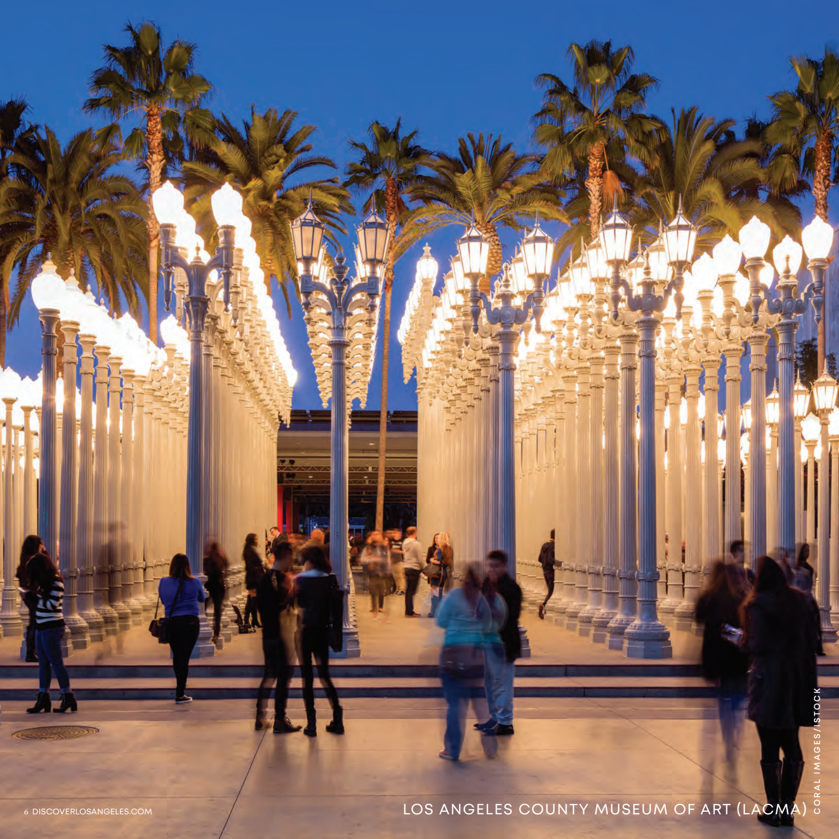
LOS ANGELES COUNTY MUSEUM OF ART (LACMA)