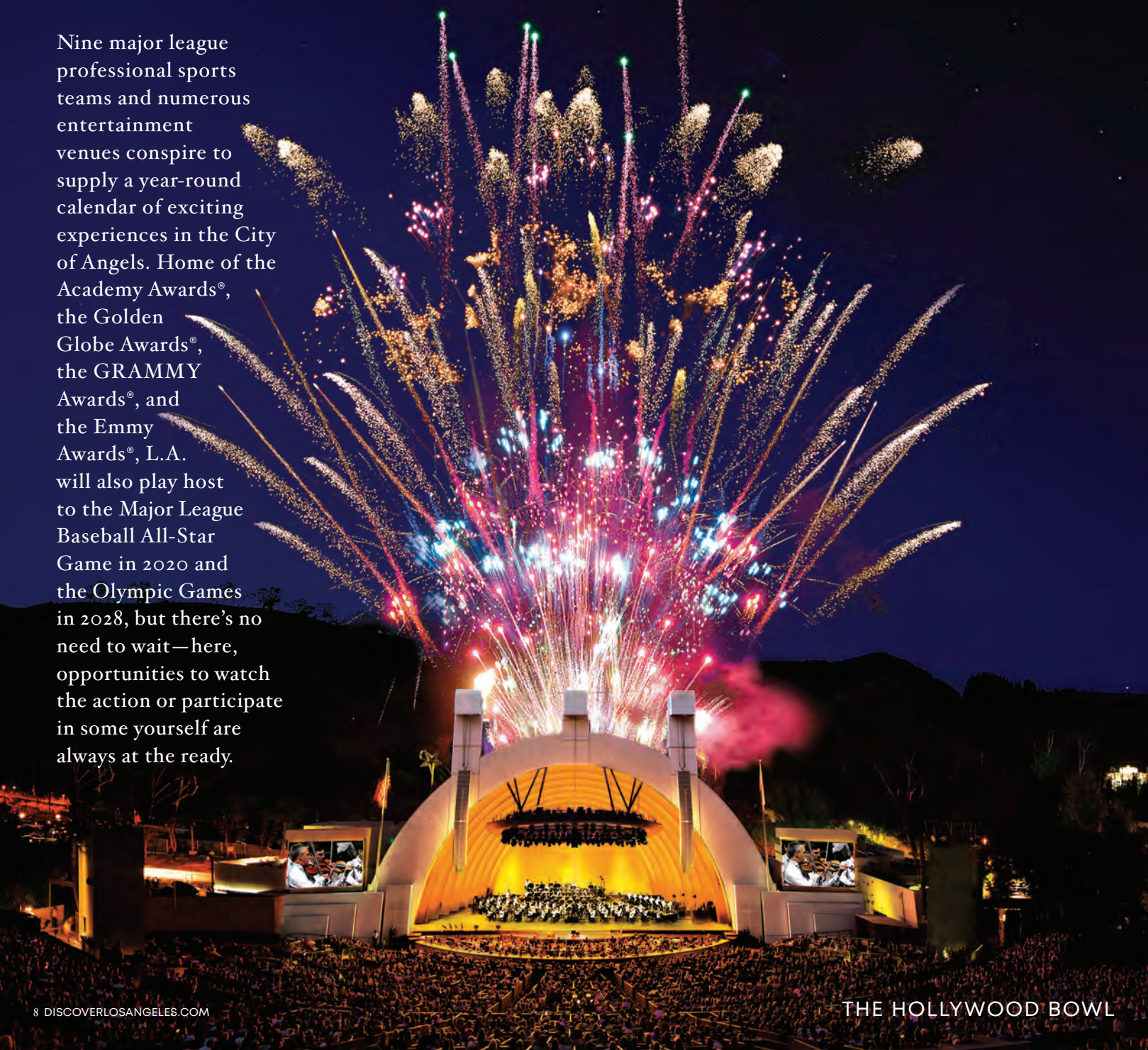
THE HOLLYWOOD BOWL

Nine major league professional sports teams and numerous entertainment venues conspire to supply a year-round calendar of exciting experiences in the City of Angels. Home of the Academy Awards®, the Golden Globe Awards®, the GRAMMY Awards®, and the Emmy Awards®, L.A. will also play host to the Major League Baseball All-Star Game in 2020 and the Olympic Games in 2028, but there's no need to wait—here, opportunities to watch the action or participate in some yourself are always at the ready.