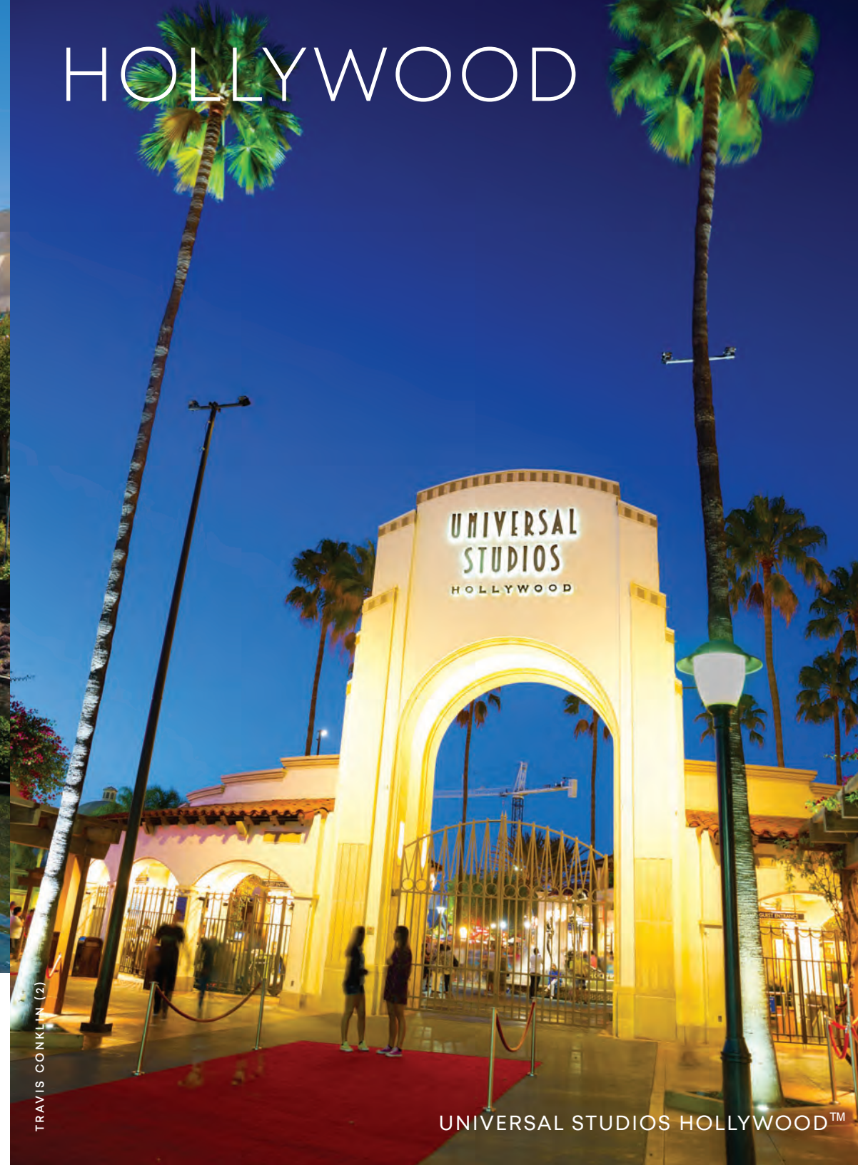
TRAVIS CONKLIN (2)