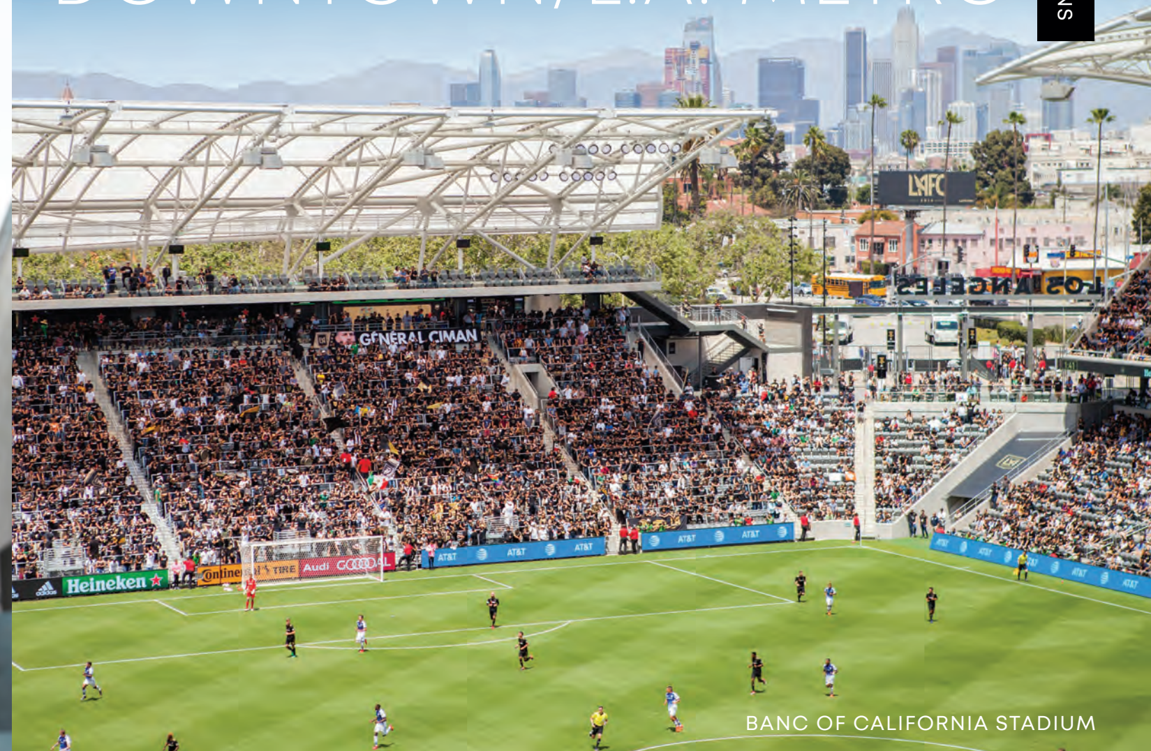
BANC OF CALIFORNIA STADIUM

DOWNTOWN LOS ANGELES HAS EXPERIENCED a renaissance. Hip hotels, trendsetting restaurants, world-class sports and entertainment venues, and renowned museums sustain a thriving cultural scene and a vibrant nightlife along walkable streets. The L.A. LIVE entertainment complex offers restaurants, live music forums, Microsoft Theater, bowling alley/eatery Lucky Strike, and movieplex Regal L.A. LIVE: A Barco