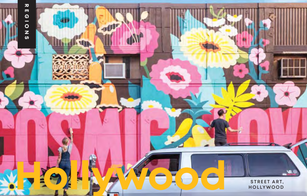
STREET ART, HOLLYWOOD

RIGHTFULLY KNOWN AS THE ENTERTAINMENT CAPITAL OF THE world, Hollywood is an essential part of the Los Angeles experience for millions of visitors each year. Explore the Hollywood Museum, TCL Chinese Theatre, and the Hollywood Walk of Fame, where lasting star tributes to celebrities have been cast in brass and terrazzo for more than 50 years. Visit the nearby Dolby Theatre®, site of the Academy Awards®. It's located at Hollywood & Highland, a complex at the iconic intersection where shopping, dining, and entertainment opportunities surround a spectacular courtyard modeled after the massive sets of the 1916 silent film Intolerance . Not far away, at Universal Studios Hollywood™, get a look behind the scenes at a working back lot and experience rides that bring popular films such as the Harry Potter blockbusters to life. The Warner Bros. Studio Tour Hollywood offers fans a daily glimpse of filmmaking magic with tours in multiple languages of the studios' back lots, an archive with sets from The Big Bang Theory , and a backstage look at one of the many soundstages. In addition to entertainment and studios, Hollywood encompasses neighborhoods such as Thai Town and Little Armenia, offering a rich array of ethnic cuisines. Fresh California produce can be purchased whole at Hollywood Farmers' Market as well as enjoyed in chef's creations at restaurants like Yamashiro and Japan House cultural center and restaurant.