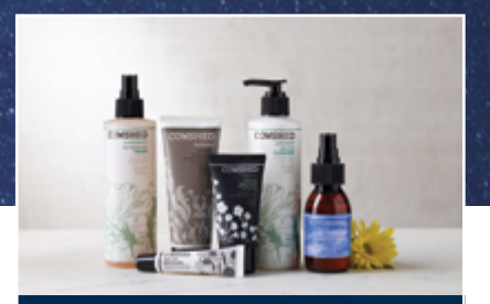
Sleep-themed amenity kits help flyers stay relaxed and refreshed