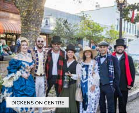
DICKENS ON CENTRE